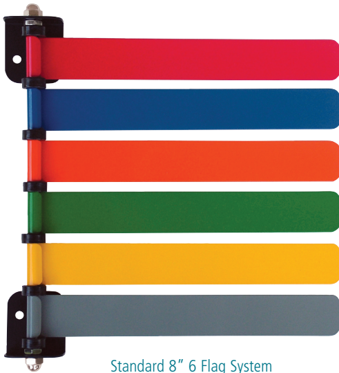
Standard 8" 6 Flag System #291706