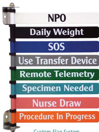
Custom Flag System