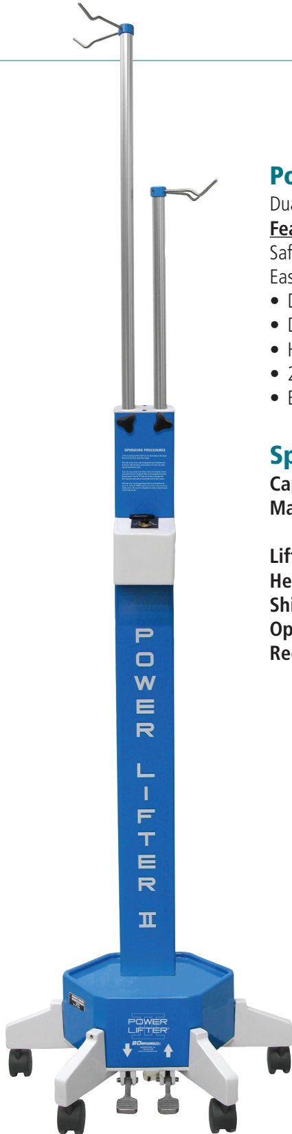
Power Lifter II® #741315